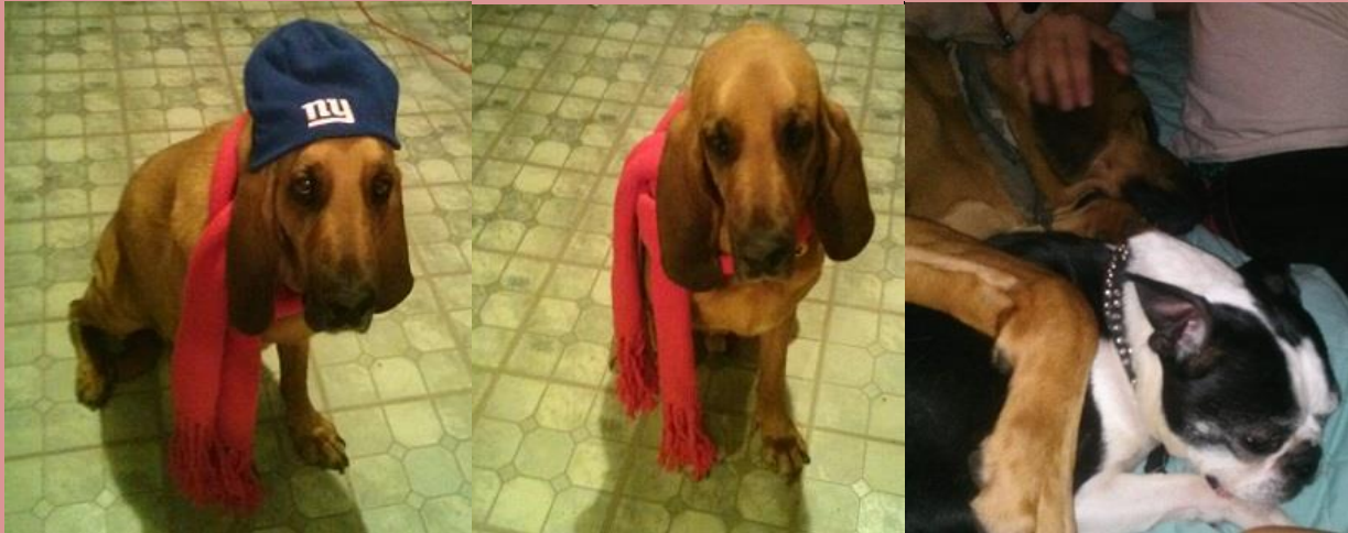
Getting ready for winter and family time.