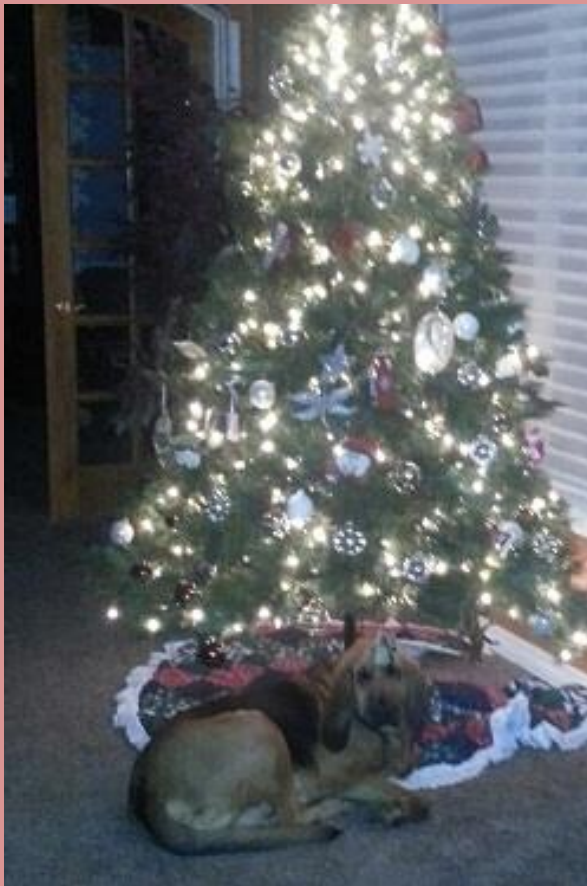
Boscoe just became a part of the family after the loss of their previous adoptee Beau. He is settling in and hasn't yet destroyed anything on the tree.