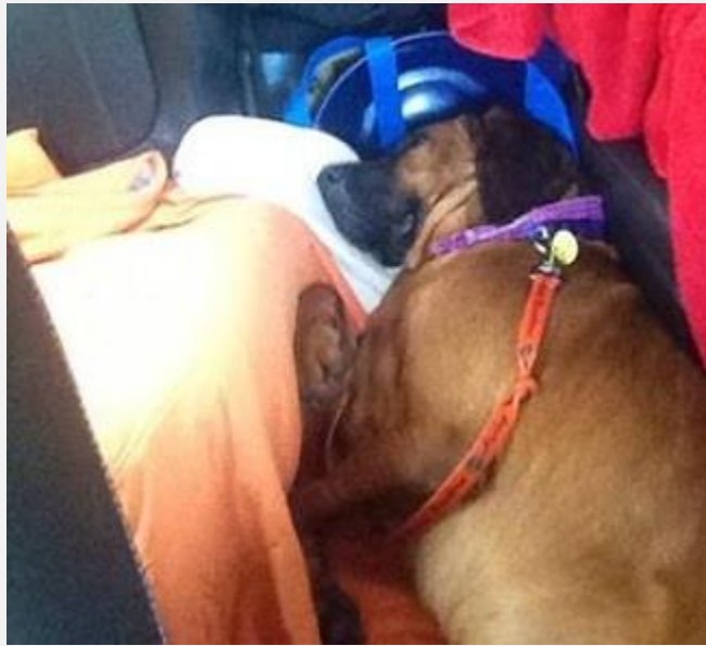
Abigail feeling the stress of travel